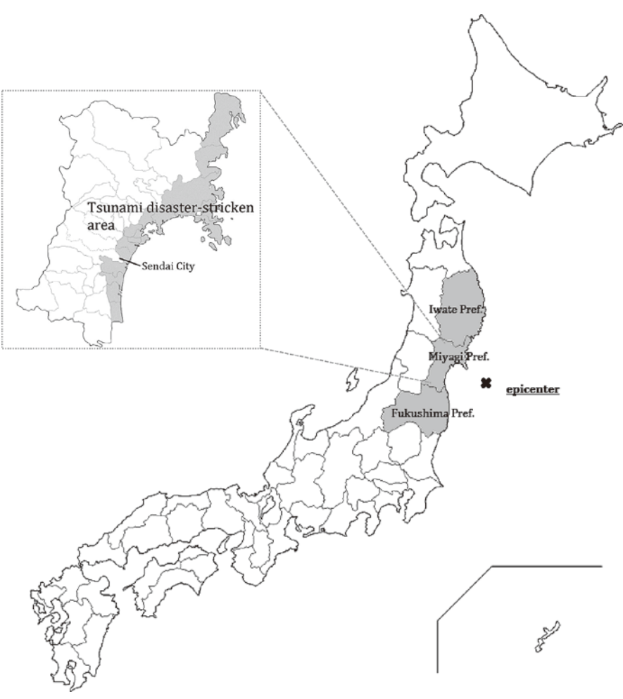
Fig. 1. Epicenter of the Great East Japan Earthquake and Tsunami Disaster-Stricken Areas. The Great East Japan Earthquake occurred on March 11, 2011, generating a massive tsunami. The tsunami reached a maximum height of 9.3 m and traveled up to 10 km inland. The tsunami disaster-stricken area was defined in this study as comprising 16 municipalities proximal to the Pacific Ocean in Miyagi Prefecture. Inland areas were defined as other municipalities in Miyagi Prefecture that were damaged by the earthquake.

The Great East Japan Earthquake occurred on March 11, 2011, at 14:46 Japan Standard Time (JST). The maximum seismic intensity level reached seven near the earthquake's epicenter (Fig. 1), and the